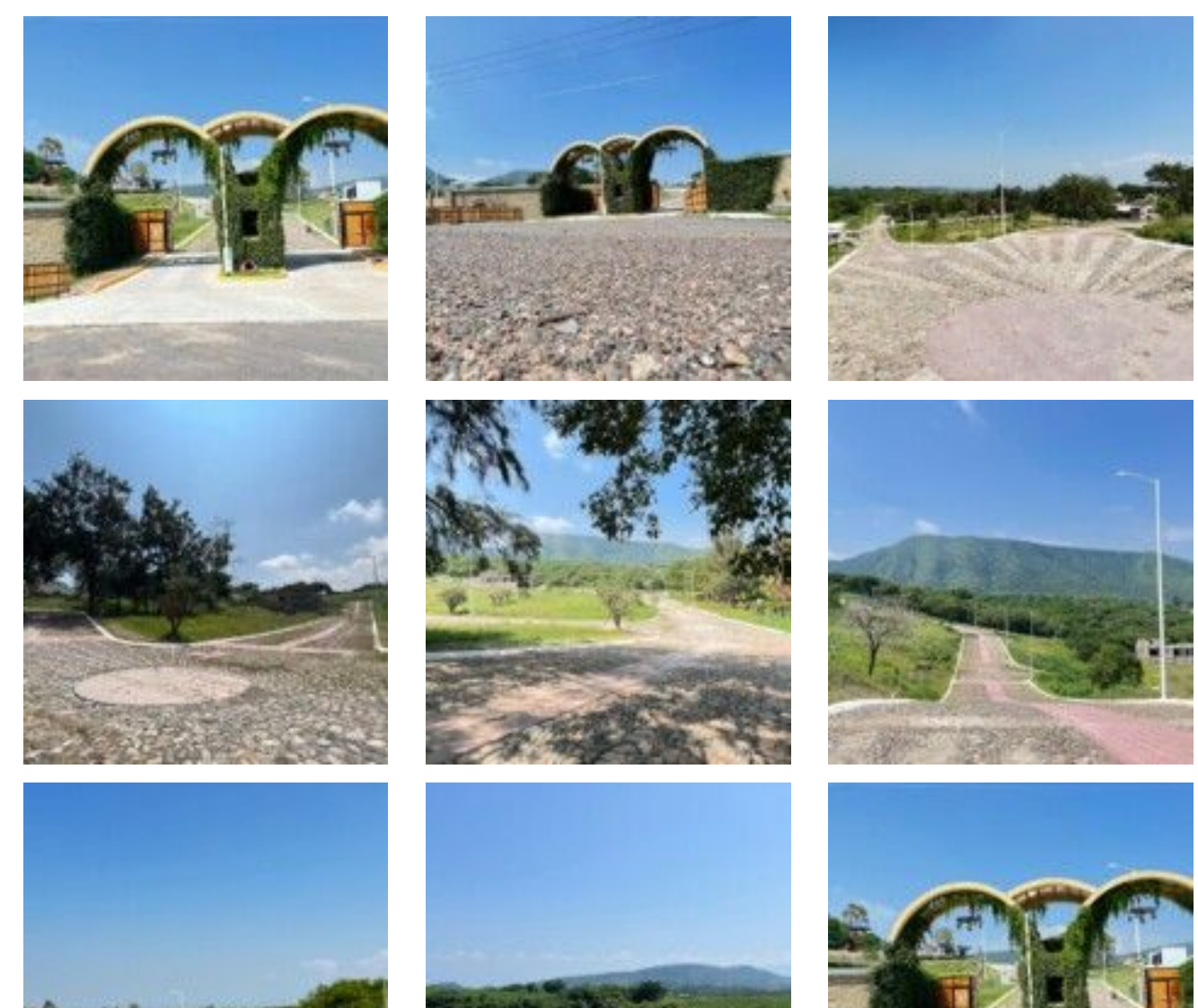
Address: Priv del manantial Lote 69