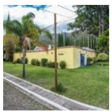
Address: Paseo del Mirador, 307