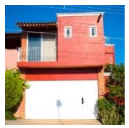
Address: Paseo del Tepalo 10